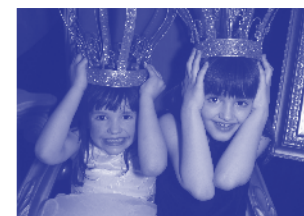
Parents' Quest for the Cure Gala: truly a plum affair