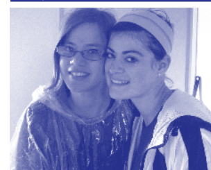
KCCFA teen leaders help in Mexico