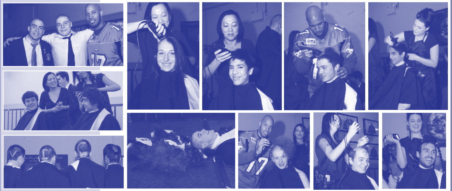
West Island College students show school spirit.