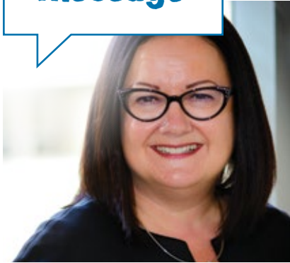
Unique Perspectives Photography