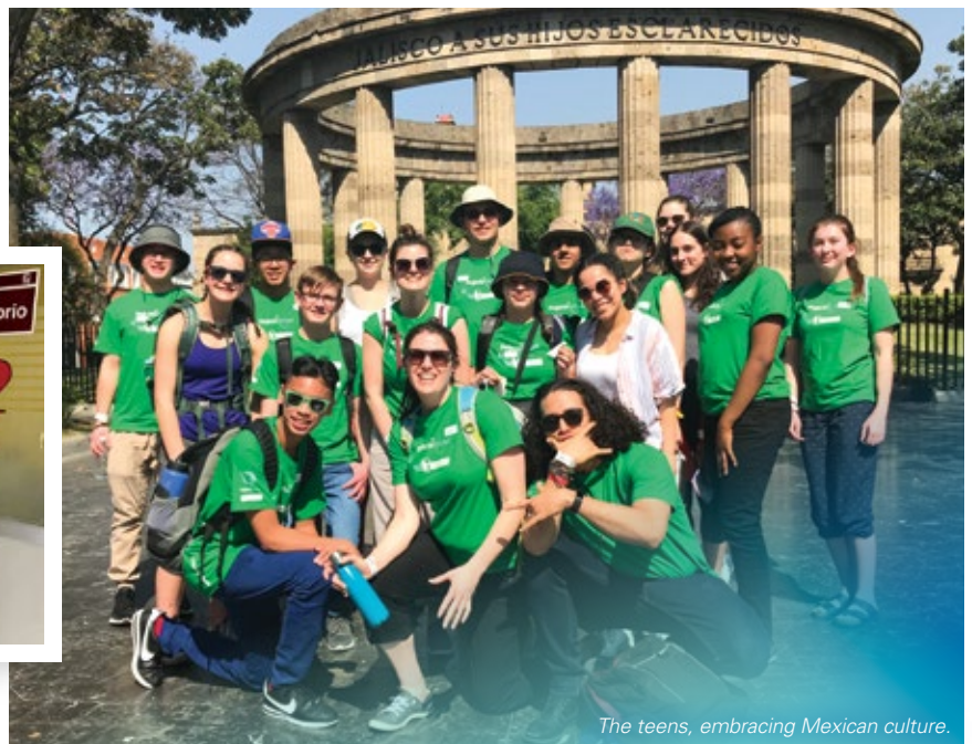
The teens, embracing Mexican culture.